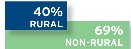
PERCENT OF COMMUNITY COLLEGE CAMPUSES THAT HAVE 100% SMOKE AND TOBACCO-FREE POLICIES – COMPARED BY RURAL AND NON-RURAL